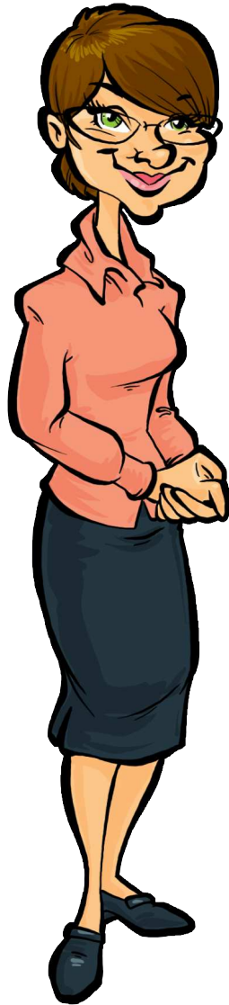
OUR MISS NESS

EMPOWERS CHILDREN BY INCLUDING THE TOPIC OF BULLYING IN ITS EXPLANATIONS OF GOOD VALUES.